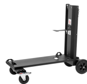
X3 4-wheel Trolley

Classic analog remote control for GXe Series 5 torches for memory channel or wire feeding adjustment. The new shape is lightweight, durable, and easy to handle with welding gloves. The channel step click can be removed by adjusting it with a small screwdriver. Plastic is more robust, and orange potentiometer fixing is improved. Compatible with Kemppi machines with remote control support.