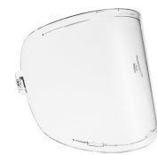
Zeta Grinding visor

Protecting the neck and shoulders from welding spatter and grinding, the universal leather neck protector can be used with all Kemppi personal protection equipment and the wider welding market.